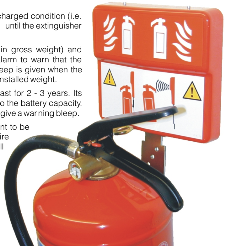
Dimensions 165w x 40d x 150h mm Long hanging strap 225mm