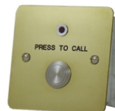
S1705BR Call Button