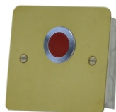
S1778BR Overdoor indicator & buzzer