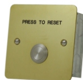
S1708BR Reset Button