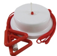
S1600-R Ceiling Pull Cord