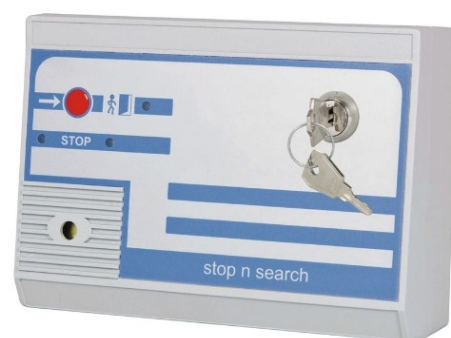
Stop n Search III