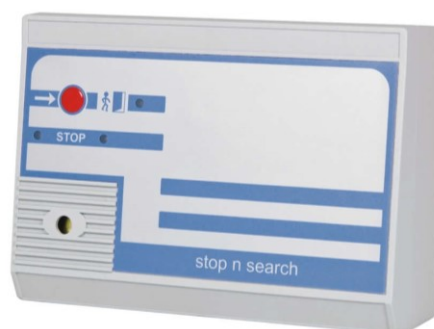
Stop n Search II